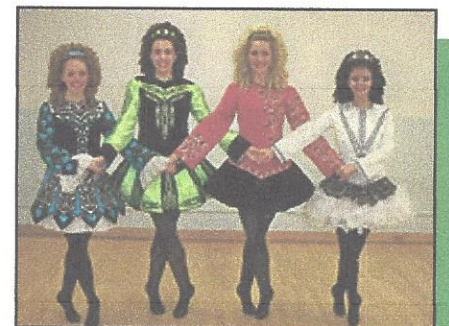
Boland School of Irish Dance

A spirited performance of talented tappers of the Boland School of Irish Dance , a local group, which has performed at regional and national venues to promote Irish culture through dance and music!